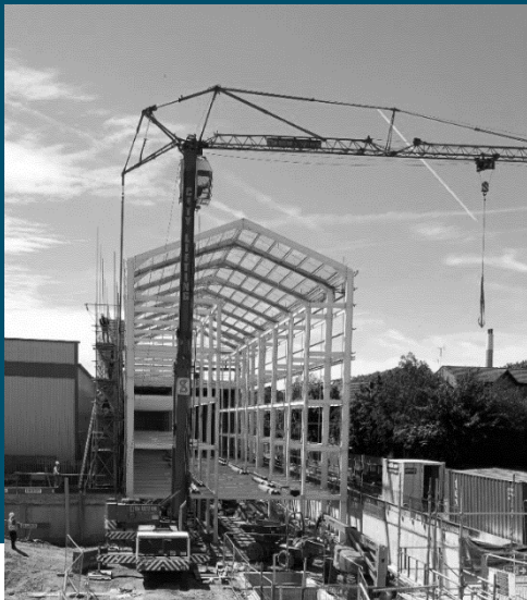
Storage facility, Deptford

As an independent project and CDM consultancy , we're committed to making our clients lives easier by providing advice that's clear, concise pragmatic and commercial.